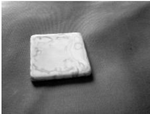
Fig. (1): The ceramic tile shows some coloring effect on its face after immersing in 10% NaOH solution for two weeks.