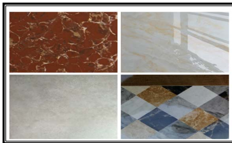
Figure 1. Some porcelain tiles used in the present work.

Eight commercial porcelain tiles were gathered from various different markets and industrial facilities. The tiles were picked from most regular Iraqi markets, see Figure 1 . Each tile was pounded into small pieces, then into fine powder by utilizing jaw crusher. The tiles were dried at 100 °C for one hour to guarantee that any moisture was expelled from the tests. In order to acquire uniform molecular sizes, a (500 µm) mesh was utilized, and then, the tiles were weighted (one kg) and transferred to a Marinelli beaker. The HPGe system which was used in the present work was a (3×3) inch, see Figure 2 . A fundamental prerequisite to estimate a gamma producer was the character of photo peaks showed in the spectrum made by the detector system. Calibration of energy was done by utilizing a standard source of Marinelli beaker of Eu-152, set up with energies (411.1, 344.3, 1408.0, 964.0, 444.6, 778.9, 1085.8, 121.8, 1112.0 and 244.7 keV).