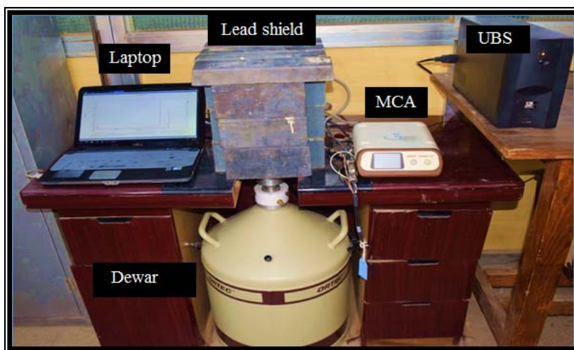
Figure 2. HPGe system used in the present work.