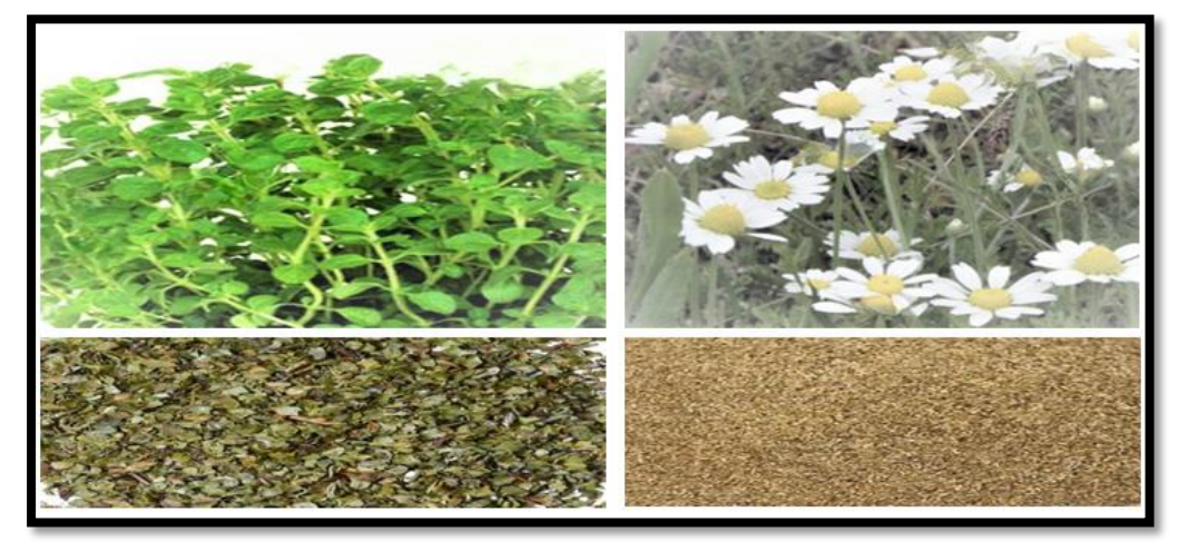
Figure 1. Origanum majorana and its powder on the left Matricaria chamomilla and its powder on the wright.

activity of the essential oil extracted from the plant's aerial section [6-8]. The Asteraceae family includes the well-known medicinal plant species chamomile ( Matricaria chamomilla L. ), which is frequently referred to as the "star among therapeutic species." It is now a very popular and widely utilized therapeutic herb in both folk and traditional medicine. Years of conventional and scientific use and research have confirmed its multitherapeutic, aesthetic, and nutritional properties Figure 1 . Numerous chemical and biological interactions could result in food deterioration. To prevent food from deteriorating due to bacteria and chemicals, in order to keep food quality at the required level and to maximize nutritional benefits, food preservation comprises a variety of food processing techniques. Food preservation techniques include growing, harvesting, processing, packaging, and distribution of food are all examples of food preservation techniques. The main goals of food preservation are to provide value-added goods, provide dietary variety, and combat improper agricultural planning. [9]. Plants are well-known for their historical use as medical herbs to treat disorders of the neurological and gastrointestinal systems. Since consumers worldwide wish to explore alternatives to antimicrobial treatments based on natural components, the use of synthetic antimicrobial agents for food safety has come under scrutiny recently [10].